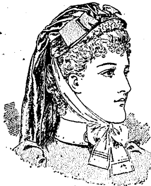
The "St. Bride's" Bonnet. Made of fine Straw with Lace and ruching, and trimmed with Ribbon, and long Silk Gossamer Fall. In black and colours, 12/6 each. Without Fall, 9/6; also The "St. Clare" Bonnet. 6/11 complete.